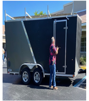
Eyeglasses for Recycling were collect by the District at the District Meeting